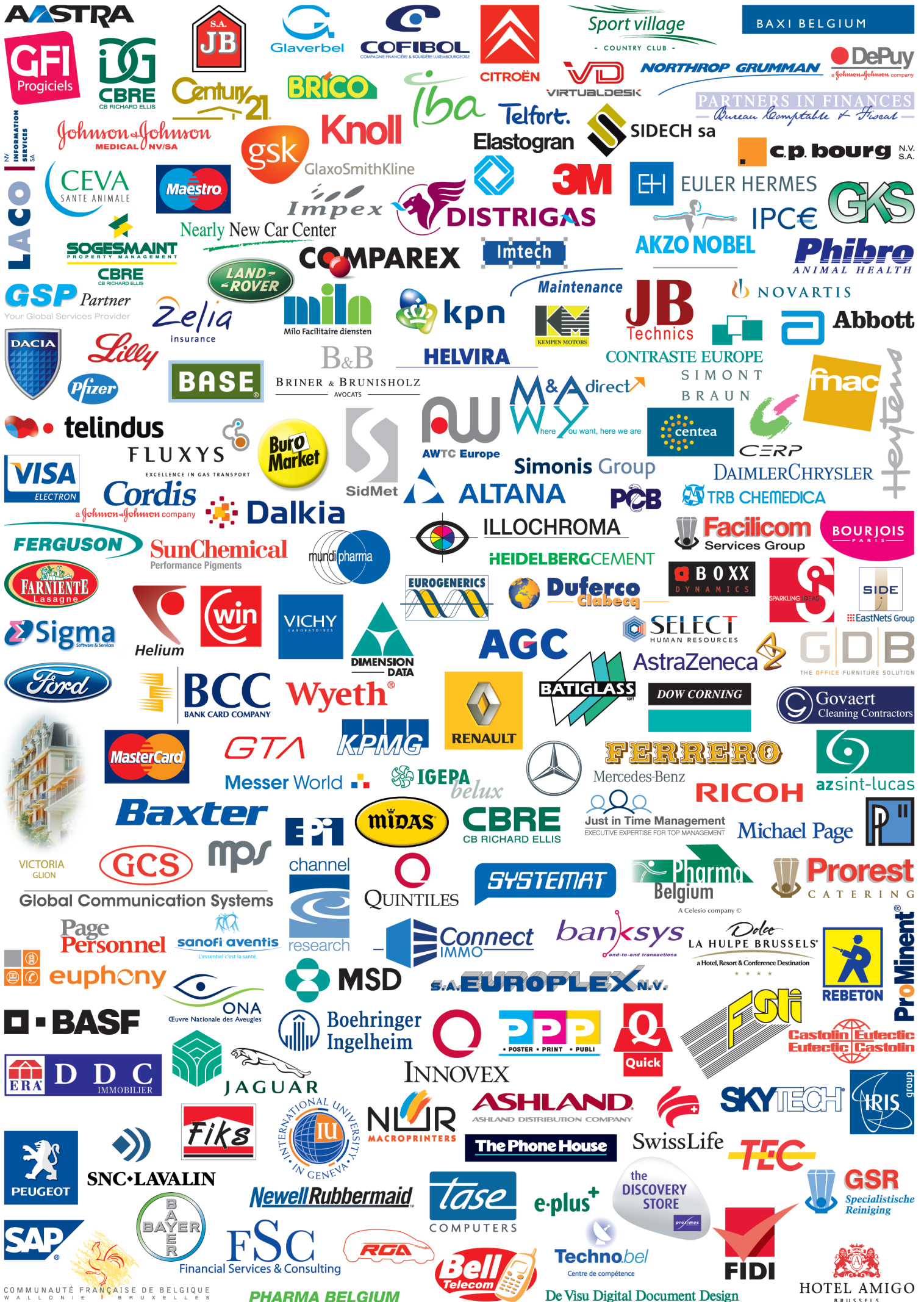
The logos above are trademarks